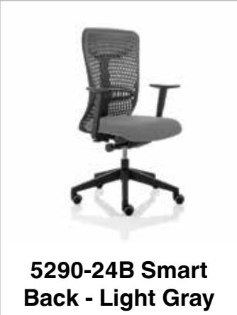
5290-24B Smart Back - Light Gray