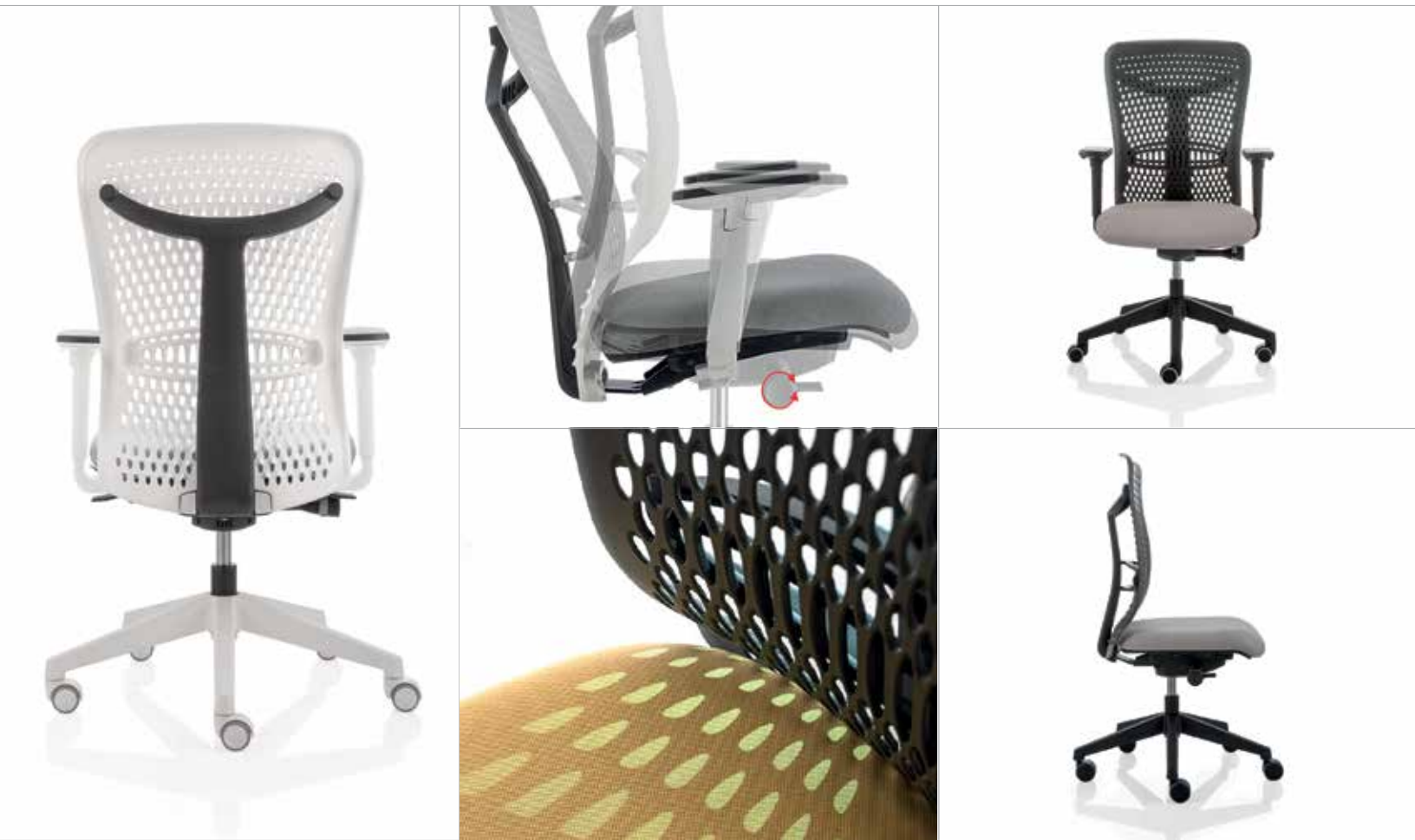
Synchron mechanism, height adjustable, flexible back with adjustable lumbar support, 2D adjustable arms, sinuous, thin profile. It's Smart.

Sometimes the smart choice is the easy choice. Sometimes we just know.